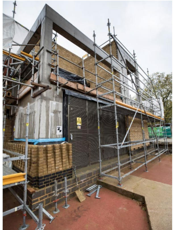
Figure 4 - Brickwork cladding on the headhouse

We will continue providing written updates like this next year. If you are interested in taking part in a virtual Community Liaison Group one evening in January, please let us know by emailing nle@tfl.gov.uk with the subject line KENNINGTON PARK VIRTUAL CLG. We will respond with further information in January.