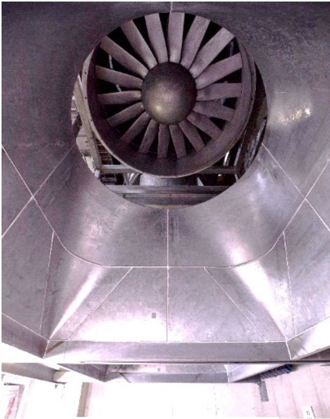
Figure 3 - Tunnel ventilation fan